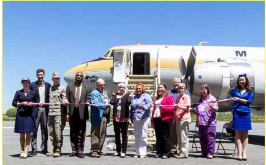
May ribbon cutting opens repainted Martin 4-O-4 airliner to the public.