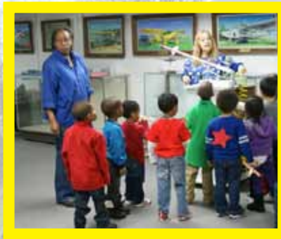
Children learn how to build their own rockets.