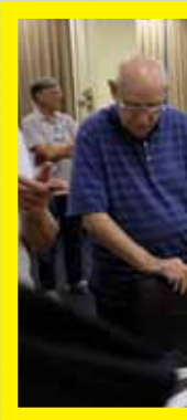
B-26 Pilot L... the monthly