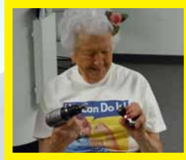
A Rosie the Riveter holds rivet gun like the one she used in World War II. The Rosies often visit the museum.