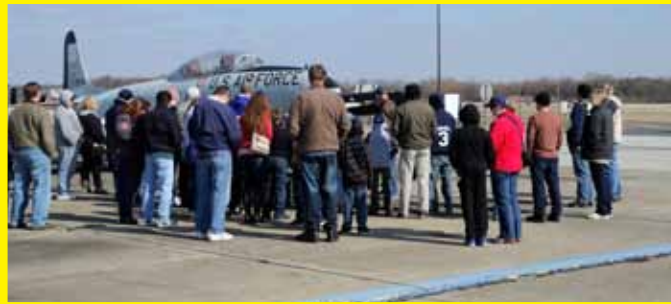
Boy Scouts got a close look at aircraft during Aviation Day.