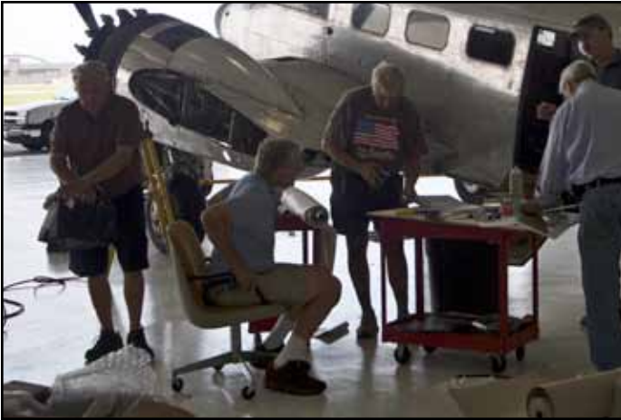
Saturday crew works on the Museum's Beech 18s.